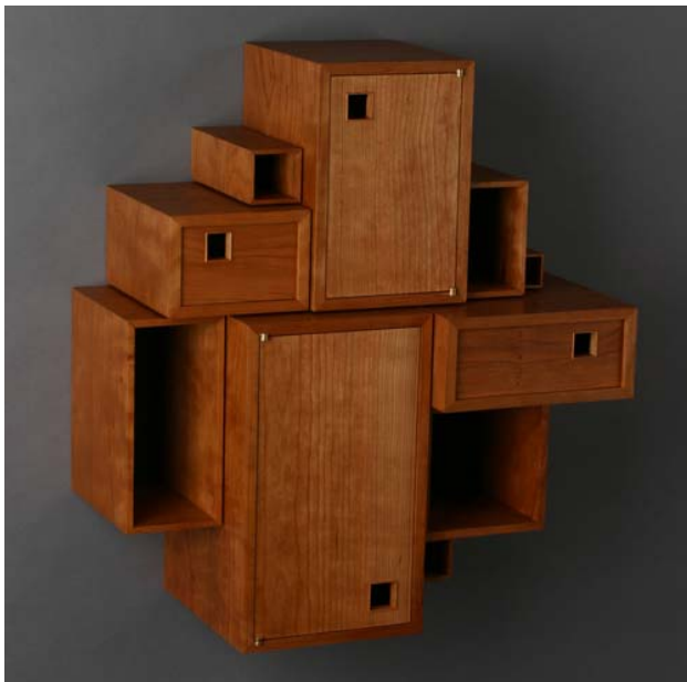
10 Small Boxes Huddled Together for Warmth

nia had to offer, and continued additional study at the College of the Redwoods' Fine Woodworking Program.