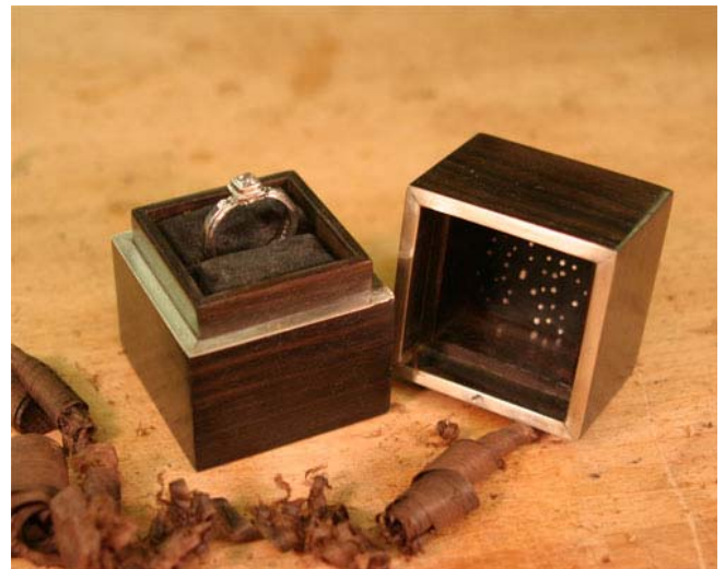
Ebony Ring Box