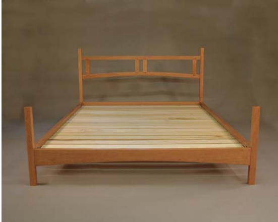
Mandell Bed, Cherry, Texas Ebony, & Poplar