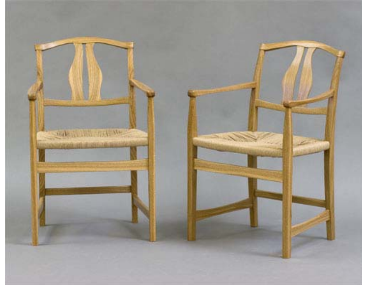
Vidar Chairs, made of white oak & Danish cord