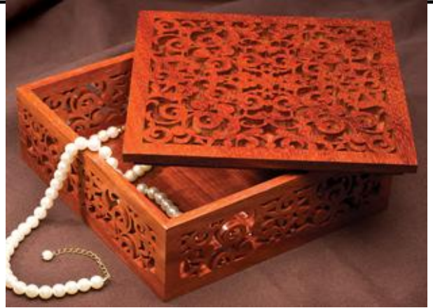
TR087 Victorian box fret lid and sides 7" square $6.50

To see a variety of box patterns for various uses visit the Boxes section: http://www.scrollsawartist.com/scrollsawpatterns