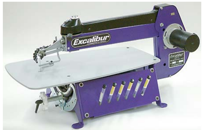
The Grand Prize—Excalibur EX-21 Scroll Saw

Contacts for the 2008 Texas Scroll Saw Picnic are www.dfwscrollers.com , phone at 469-360-9938, or email at lbworkshop@verizon.net .