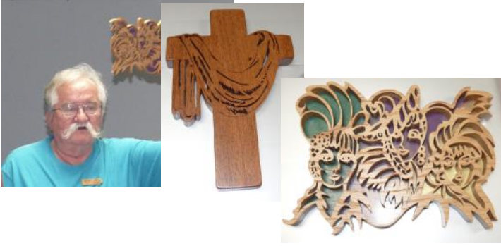
Norm Nichols , playing with different woods, crafted a cross out of leopard wood and a mardi gras scene of three ladies made from red oak