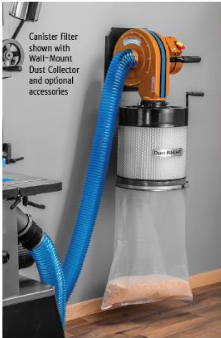
Canister filter shown with Wall-Mount Dust Collector and optional accessories