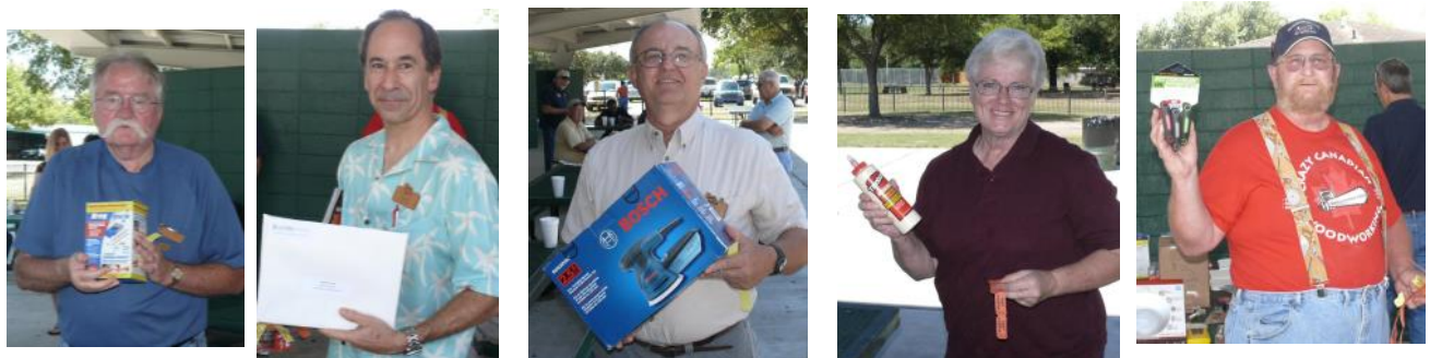
Here are just a few of the other raffle winners. Congratulations to all prize winners!