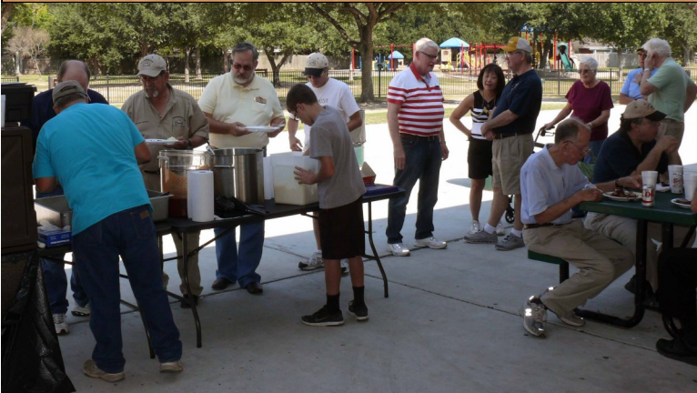
Members line up for some delicious BBQ.