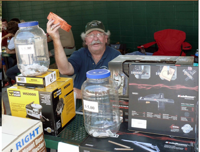
The raffle master selling tickets.