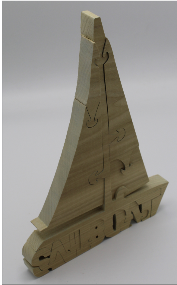
Sailboat Word Puzzle