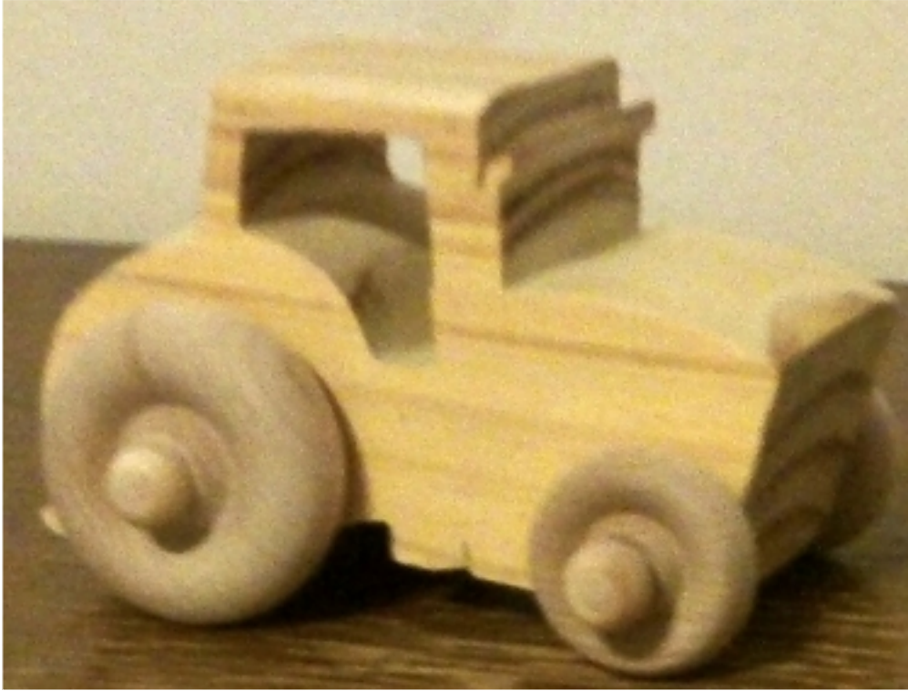
John Deere Tractor