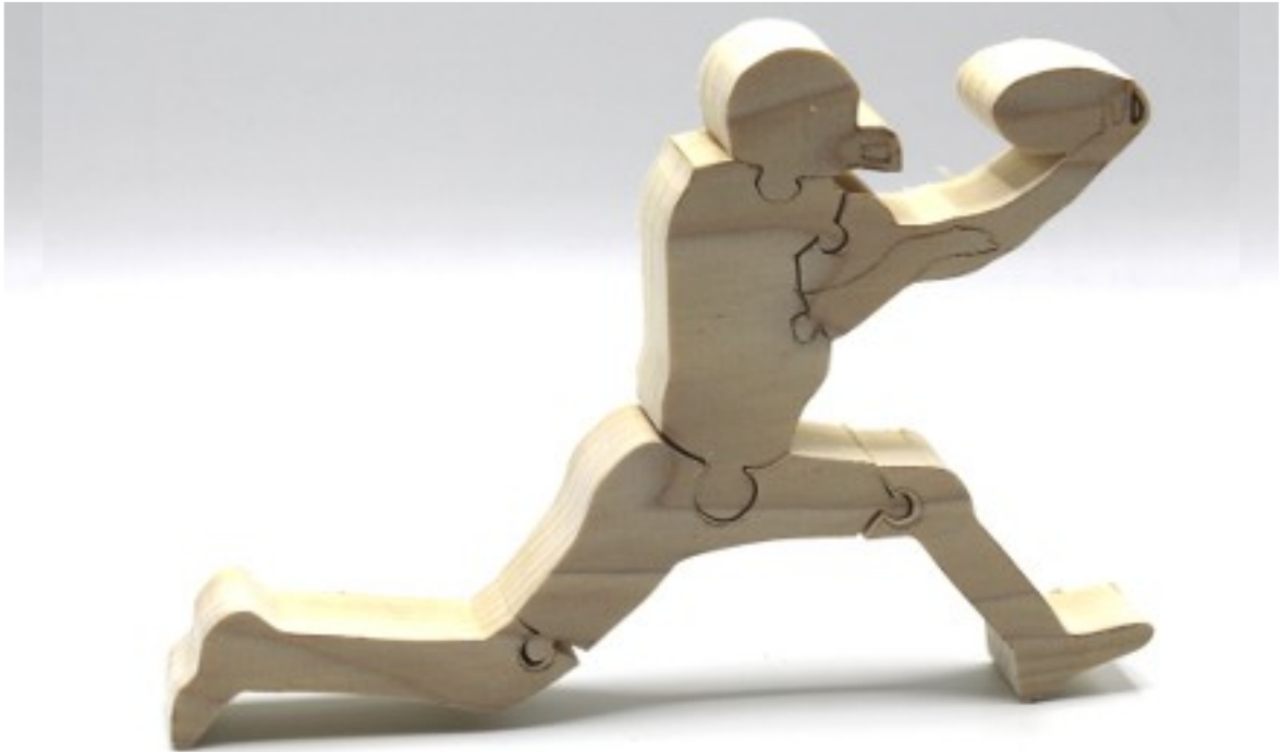
Football Wide Receiver Puzzle