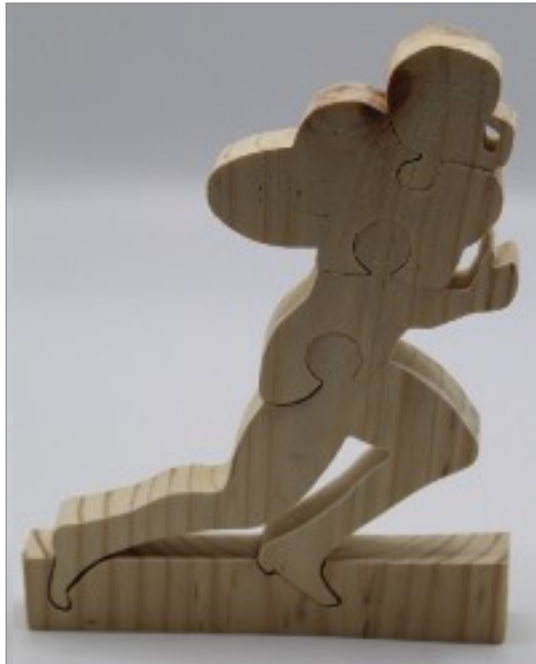
Football Running Back Puzzle