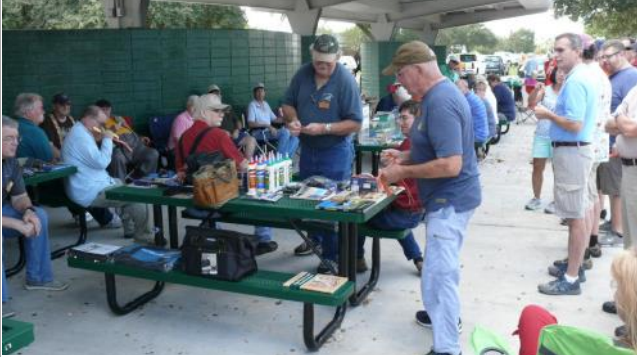
Members enjoying the raffle.