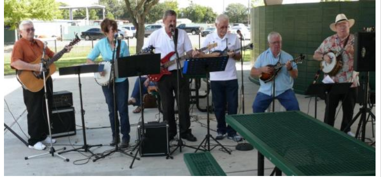
Music provided by Texas Sky.