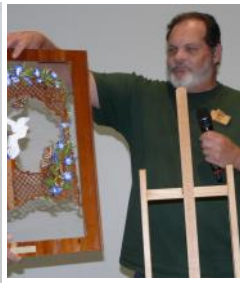
Rick Spacek - "In the Garden" scroll sawed in cedar with plexi-glass backing to prevent breakage of small pieces.