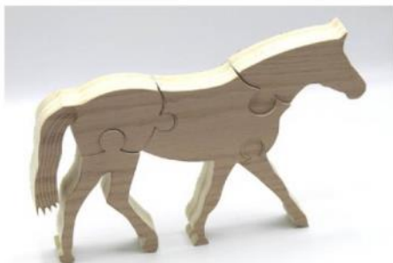
Horse v2 Puzzle