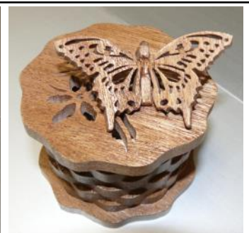
Dave VanDewerker - Jewelry boxes of mahogany and maple, and a jig/clamp for joining box sides at 90 degrees from Wink wood.