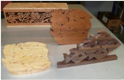
Chuck Meeder - Wine box and fish puzzles from cherry, maple, walnut, cottonwood, and mahogany.