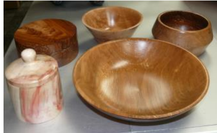
David Janowitz - Turned bowls and coffee table of water oak, pear, and hui-sa-che.