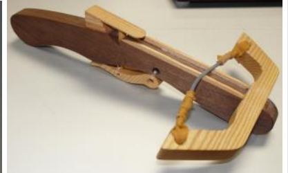
Tom Pauley - Marshmallow crossbow shooter from ash and walnut.