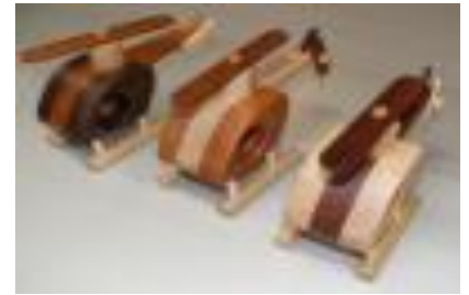
Denis Muras - Toys for WWCH Toy Program from various woods