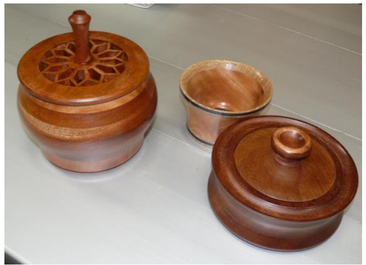
George Graves - Turned Bowls