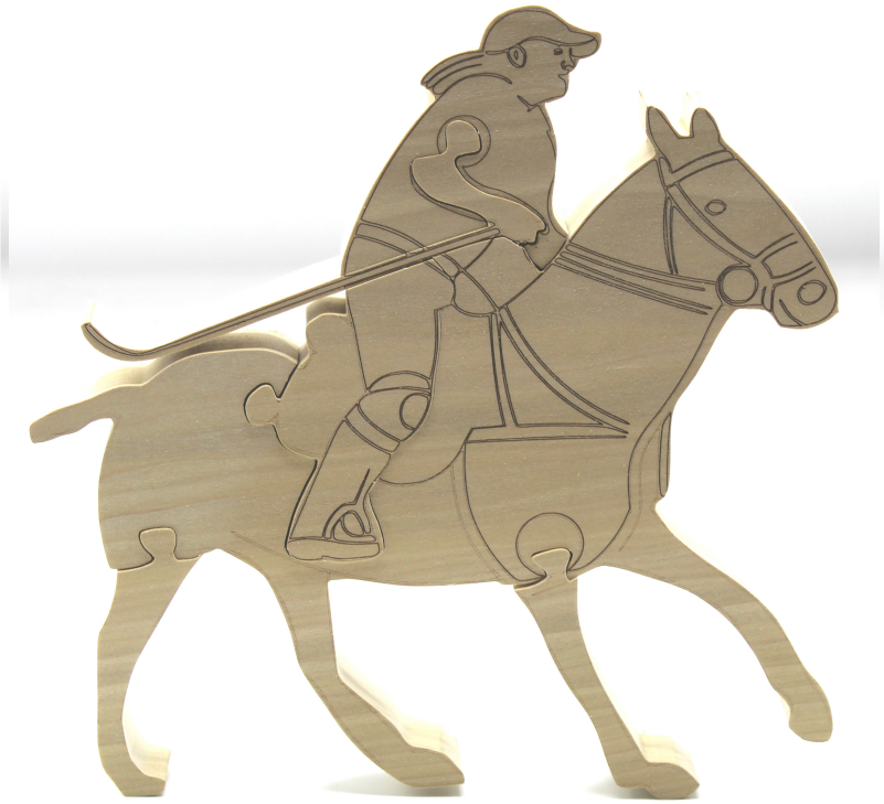
Female Polo Player Puzzle