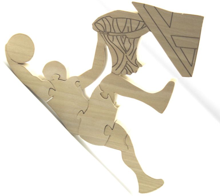
Basketball Player Dunking Puzzle