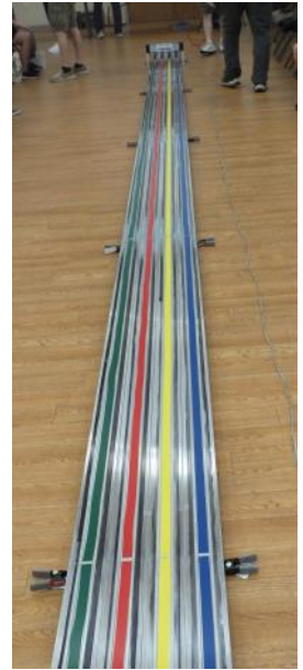
Greg Solberg 2nd Place