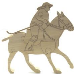
Female Polo Player Puzzle