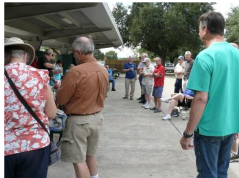
Photos from Picnic 2023