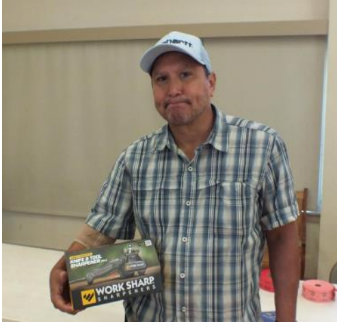
$5 Ticket Winner

Good time was had by all. Good food; fellowship and Show-N-Tell. The new location worked out well. Special thanks to the our donors for the raffle items