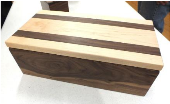
Rob Campbell - Router Bit Storage Box