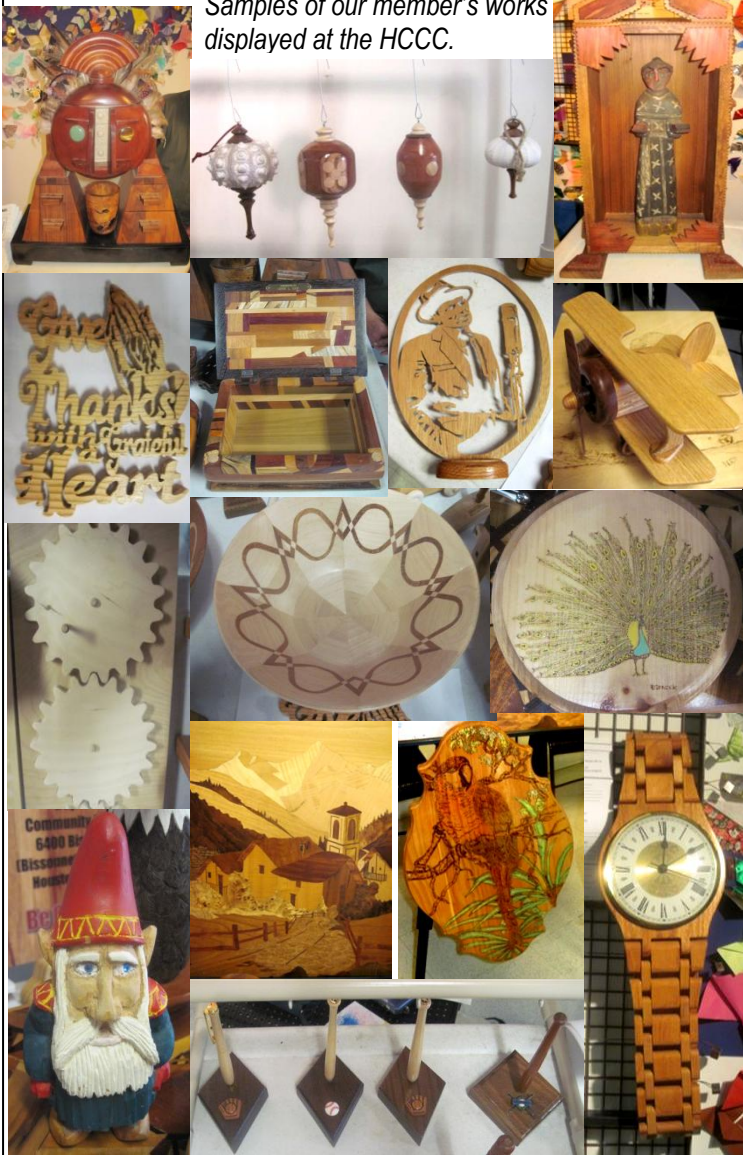
Samples of our member's works displayed at the HCCC.

Here's contact websites for anyone interested in the other guilds: