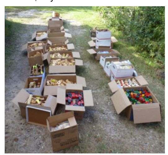
Toys boxed up and ready for delivery!