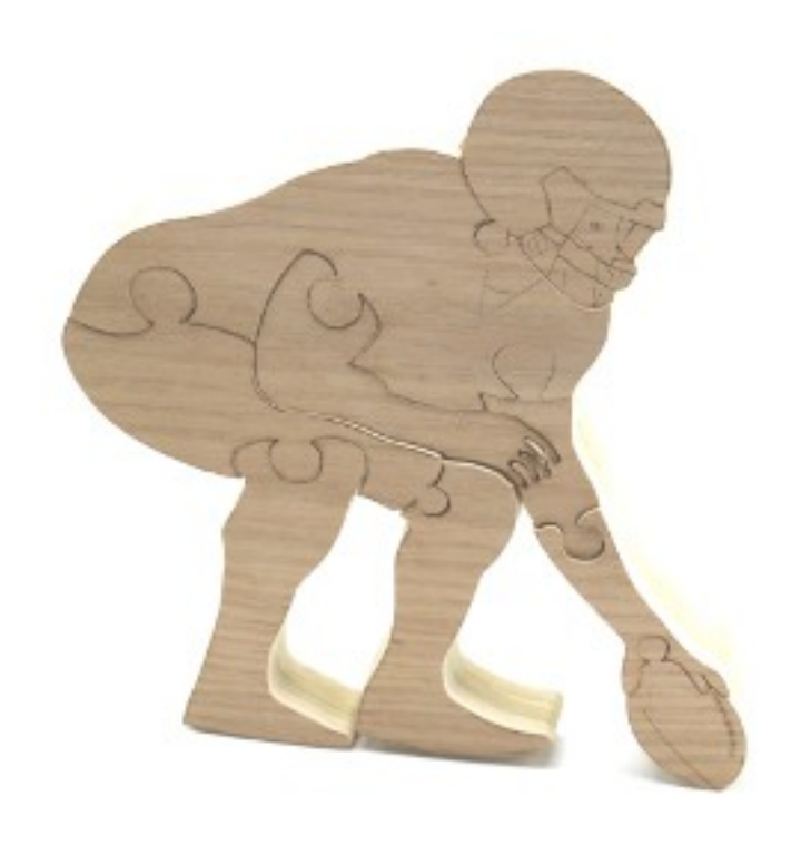
Football Center Puzzle