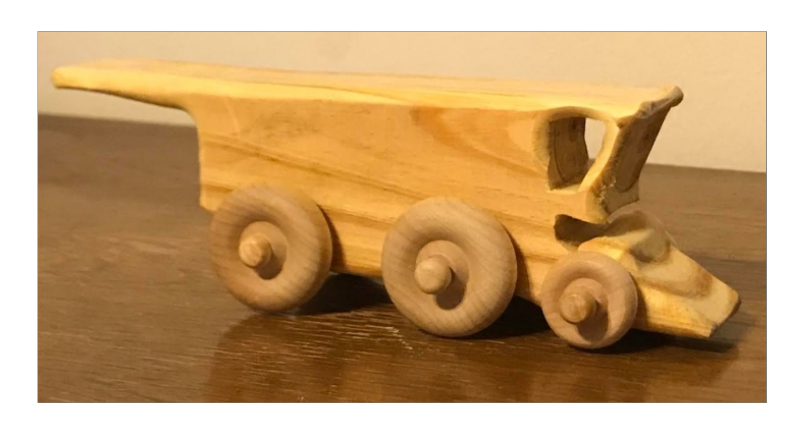
John Deere Combine