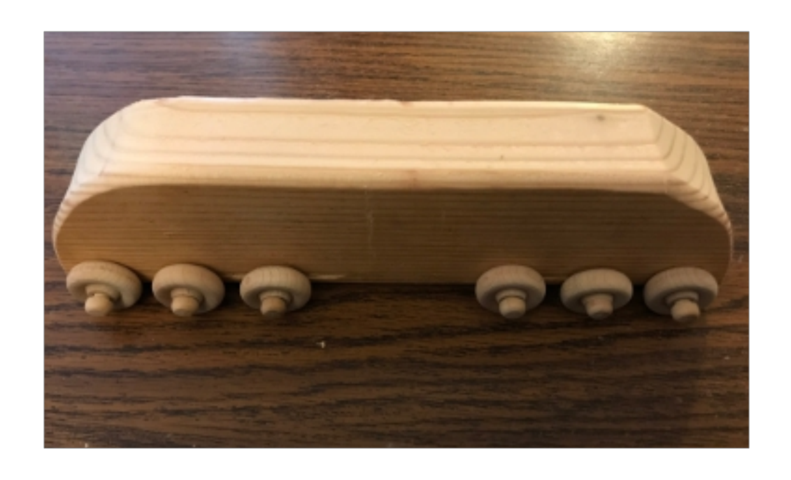
Newer Train Car