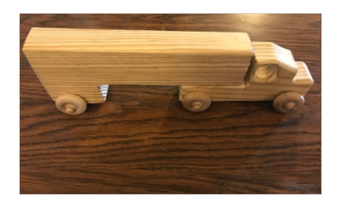
Semi Truck with Trailer