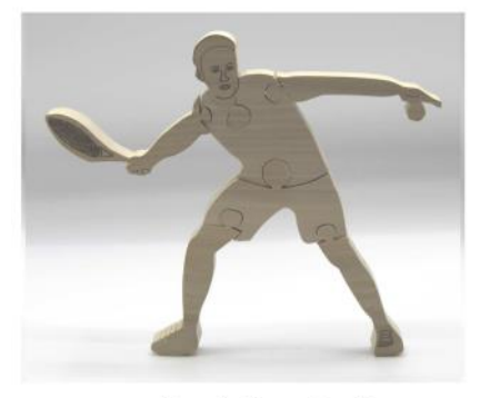
Tennis Player Puzzle